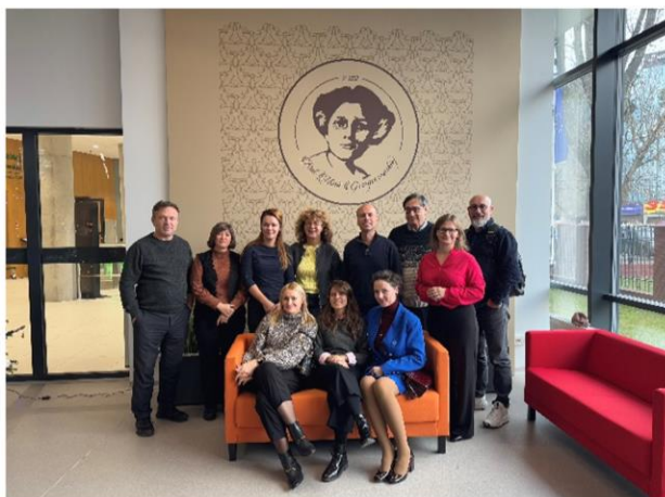
Kick-Off Meeting in Warsaw

Together, we are collaborating to create effective educational tools and teacher training programs to improve social and emotional development support for children with ASD.