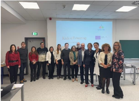
Kick-Off Meeting in Warsaw